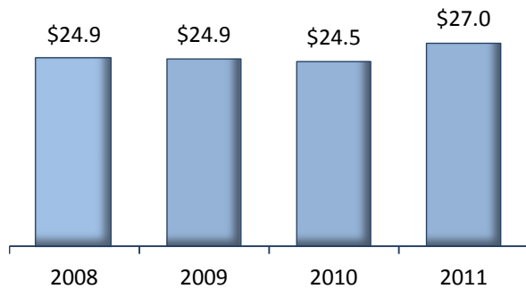
US Exports of Financial Services to EU ($ billion)

Industry Overview: The US financial services sector includes commercial and savings banks, credit card issuers and other non-depository credit intermediators, investment banks, securities brokers, and financial advisory services, such as portfolio management and investment advice. In 2011, these sectors added $720 billion to the US economy, or about 4.8 percent of total US GDP.